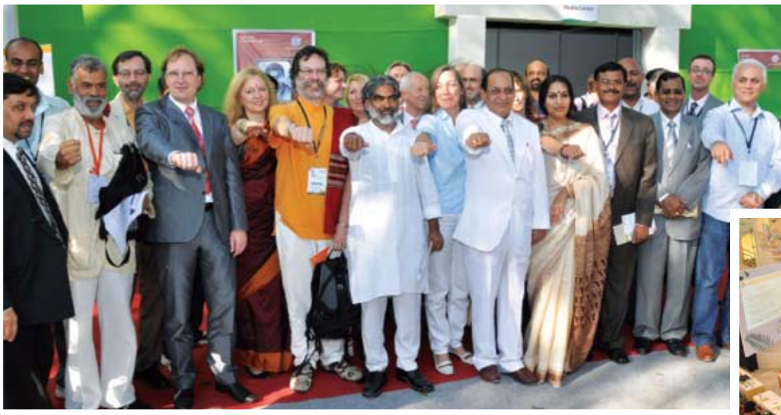
International participants pledging for the cause of Ayurveda